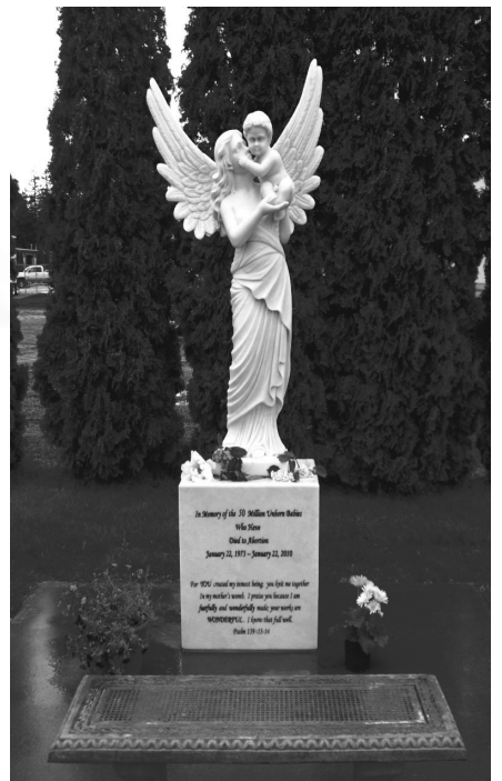
Visit our angel Memorial @ the Monumenta Cemetery in Lynden. A very restful spot.

Visit us on the web @ www.lyndenhumanlife.org